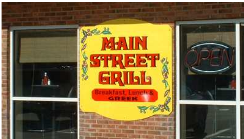
Breakfast, Lunch & Greek

I had the pleasure of meeting Mary & Billy Demarkos yesterday morning. They recently opened their restaurant, The Main Street Grill in the space formerly occupied by Uncle Sonny's, at: 201 W South Main Street, Waxhaw, NC 28173