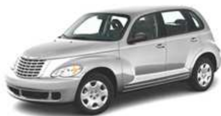
A white car similar to this was used in the attempt