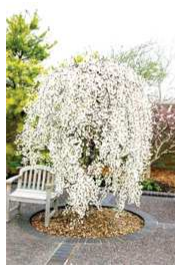
Snow Fountain Weeping Cherry Prunus serrulata x subhirtella 'Snofozam'