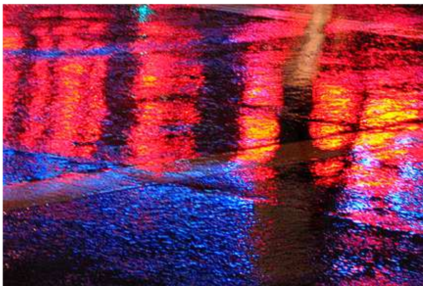
Could this be the only image of our runner?

“I was so surprised by the sight I didn’t really get as good look at who the person was”. With only a pair of running shoes and a head band on, not to mention the distance observed from, the age and gender wasn’t identifiable.... “coulda been a girl or a skinny guy I guess, but sure didn’t look like they had any clothes on to me tho” the informant said.