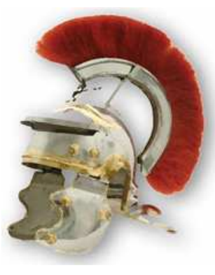
While there may still be time?

Perhaps for our representatives in Washington, a need to review "The Fall of Rome And the End of Civilization" is in order?