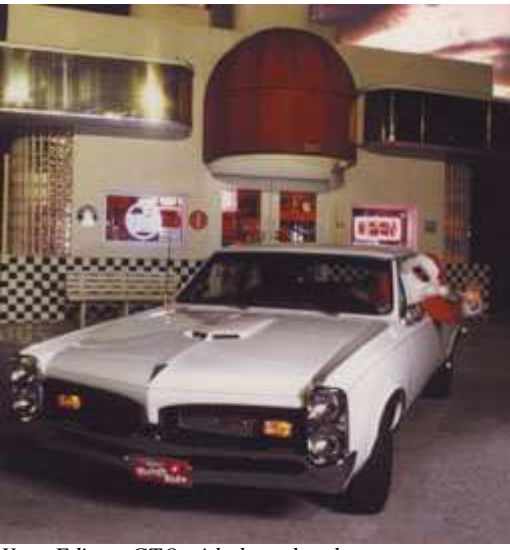
Your Editors GTO with the only other person I have ever lent it to behind the wheel. =)

boyfriend drove a beautiful 61' Bonneville Convertible. Those were the times of "Wide Track" and "We Deliver Excitement"! Back when John Z. DeLorean decided Pontiac needed a small, fast car and hit on the name GTO. The days when Detroit ruled the automotive world. Over the years I was proud to have owned a total of eight Pontiacs, three of them being GTO's of which the last still resides in my garage.