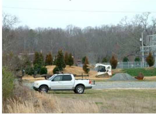
Construction underway on the landscaping berm and plantings being installed in front of the power station.

The sewers are over capacity and the state steps in with moratorium on permits. Water is in short supply. The drought brings restrictions on use, lawns are dying everywhere and a clean car is a rare sight. Commissioners accused of wrongdoing with development permitting. Legal actions are taken. .... The headlines have been full of these topics since last summer. All of these woes are a result of unbridled development in Union County. Simply put, the infrastructure can't keep up with the rate of building. Both residential and commercial and who is to blame? I don't know that anyone is to blame but people certainly have been taking advantage of the desirable growth in our area. New residents and business are coming from everywhere. Charlotte and surrounding areas, even out of state; Union County has become the place to move to. That is the simple truth.