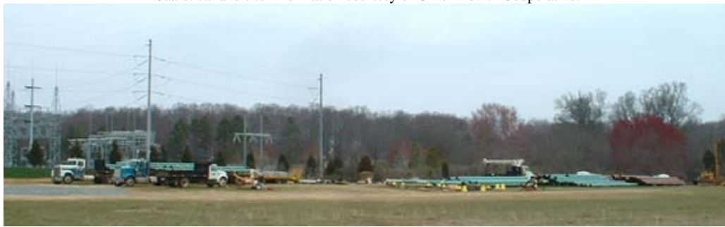
Statistical and site information courtesy of Union Power Cooperative.

Now, if we could only be so successful with getting the roads and sewers taken care of.