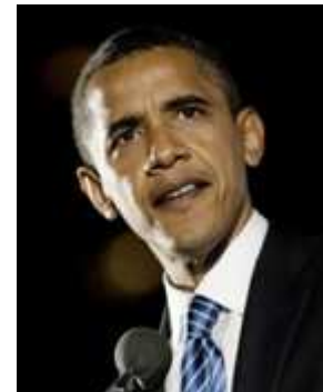
President Obama travels to Capitol Hill to seek Republican backing Tuesday.

When it came time for Congressional Leaders to vote on the newest recovery bill, the first to come from President Obama, it quickly became clear that Republicans, to a one, wouldn't support the President.