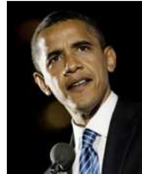
President Obama travels to Capitol Hill to seek Republican backing Tuesday.

Clearly, Republican Congressional Leaders Unsupportive of New Administration