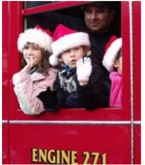
ENGINE 271 Christmas, 2010