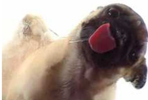
Click here to get him to work:

I noticed your screen needs cleaning so I've sent over my screen cleaner to get the thing cleaned up for you.