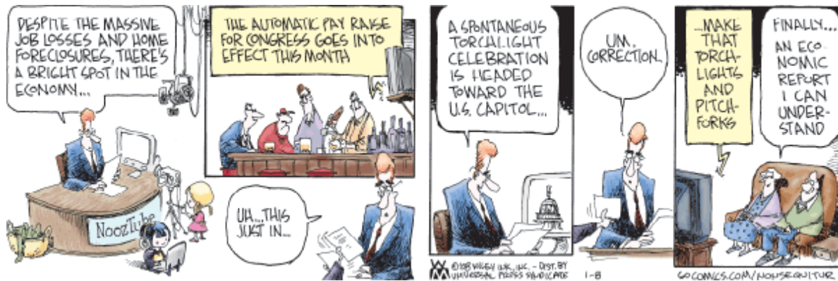
Pitchforks, I like that...

I am relieved to report that, at least the upper management at Bank of America has decided it is in their best interest not to take any year end bonuses this year. My guess is that the bad PR they got after the stock holders meeting not long ago, what with the CEO refused to pass on any of his income, at last they have realized that bonuses' would have been a major Public Relations Disaster! After all, they're only planning on firing 30,000 employees... Unfortunately, our representatives in Washington aren't paying close attention as they are going ahead and giving themselves a raise? Can you believe that, at a time like this? I think that "Non Sequitur" does a pretty good job of describing what most Americans feelings are!