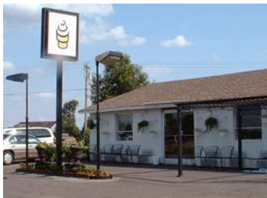
Located at 4021 Route 84 It's hard to miss the cone!

On the right side of the road, heading towards Monroe, sits a small white building all by itself. In the years I have been here the building has gone through any number of re-incarnations. I believe it was originally a gas station, and more recently a dry cleaner, then a consignment shop. Well on this hot afternoon I realized it has entered yet a new incarnation called the "Shoppe's at Willoughby" with an image of an Ice Cream Cone underneath. Immediately I was entranced, knowing I wouldn't be happy until I had the chance to come back and see just what kind of cones they were selling (I do like my ice cream)!