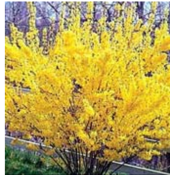
Forsythia x intermedia

Forsythia, often called Golden Bell, is one of the Forsythia most recognized plants in the south. With a growth habit of 8 - 10 feet in height, and 10 - 12 feet in width, this deciduous shrub can be shaped into a hedge, but is most beautiful when it is allowed to grow naturally into a weeping, and somewhat unkempt, shape. Tolerant of full sun and most soils, this plant blooms on old wood and flowers will typically appear in March prior to any leaf emergence. Forsythia needs plenty of room to spread and is best used as a specimen or a border grouping. So come down to the Nursery and pick up a little bit of southern charm for your landscape.