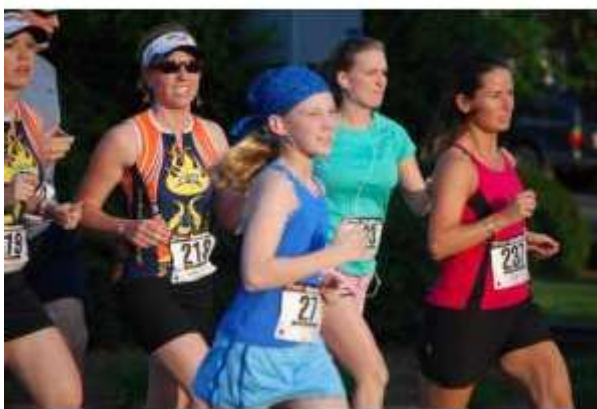
CONTROL PANEL This years' slide show.