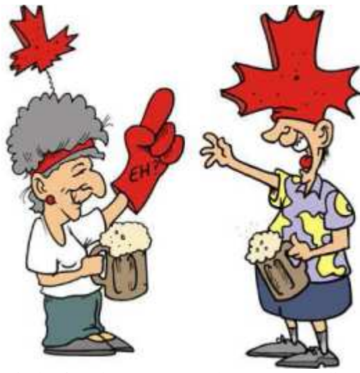
Kind Of Makes You Proud To Be Canadian, doesn't it?!!

"Dear Pop, Go ahead and plant the tomatoes now. That's the best I could do under the circumstances.*