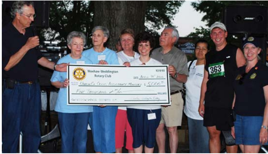
Copyright ©2010 The Waxhaw Gazette www.thewaxhawgazette.com | info@thewaxhawgazette.com Waxhaw, North Carolina | Phone 704.650-0606