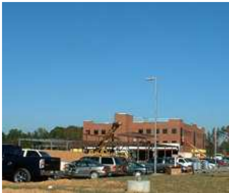
Things are moving right along here in Waxhaw!

The last project on our list today is the facility being constructed by CMC. It is well under way and even though I don't have current information on it's completion, I would suspect major construction should be done by the end of the year at latest.