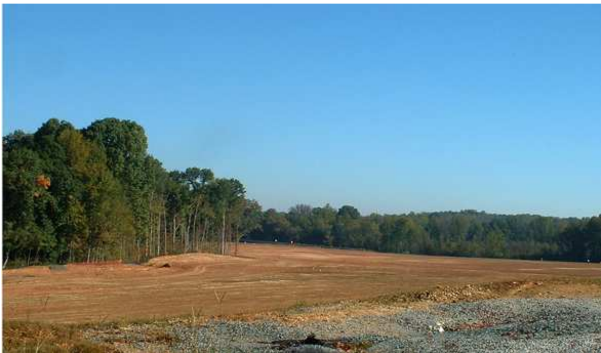
Click here to see a larger version