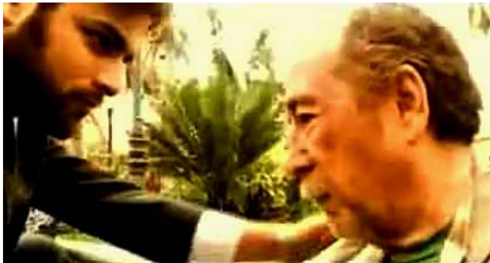
A Very well done message