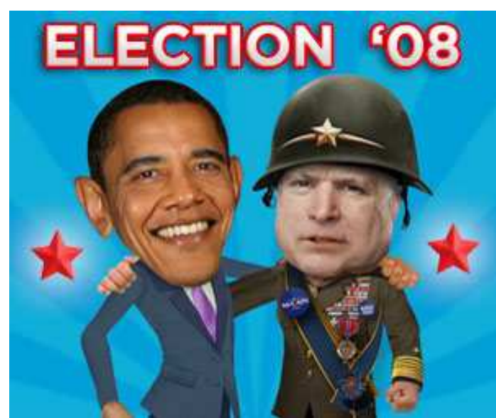
...and as Good as ever. This is GREAT!