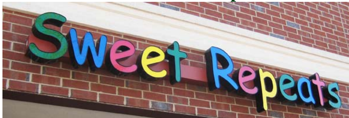
by Hunter Croswell